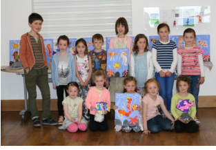
Summer Art Event

The three day children's Summer Art event held in Ballygally Community Hall turned out to be a great success. Fourteen children attended and each one produced a beautiful underwater scene. The children are to be congratulated on their hard work and excellent behaviour. The event was enjoyed by all.