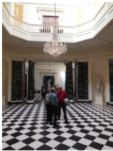
A beautiful day in Mountstewart

(Keep an eye on the noticeboard, our Facebook page and website for further details)