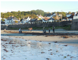
Hard at work!!