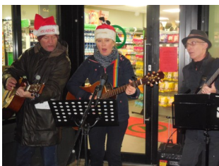
A few carols to keep everyone warm before the lights went on!