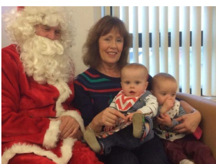
One of our sets of twins with their Granny meeting Santal!