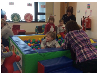
Lots of fun in the soft play at our Christmas Party