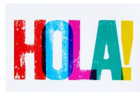
Spanish Classes Ballygally Hall Wednesday 7.30-8.30 pm

Our course is aimed at all ages and levels so, if you would like to be able to survive in Spain and communicate with the locals, please contact us and we will get some classes arranged!