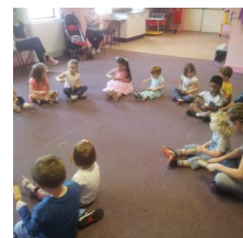
Musical Monkeys Ballygally Hall Monday 3.30-4.15pm