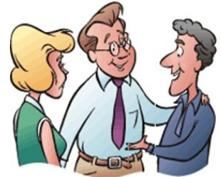
A warm and friendly place for people of all ages to make new friends and meet existing ones

(If anyone requires a lift to the hall please ring Carol on 07547158935)